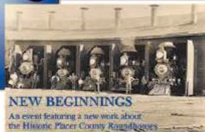
NEW BEGINNINGS An event featuring a new work about the historic Placer County Roundhouse