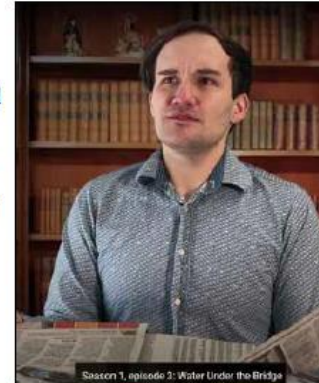
Season 1, episode 2: Water Under the Bridge