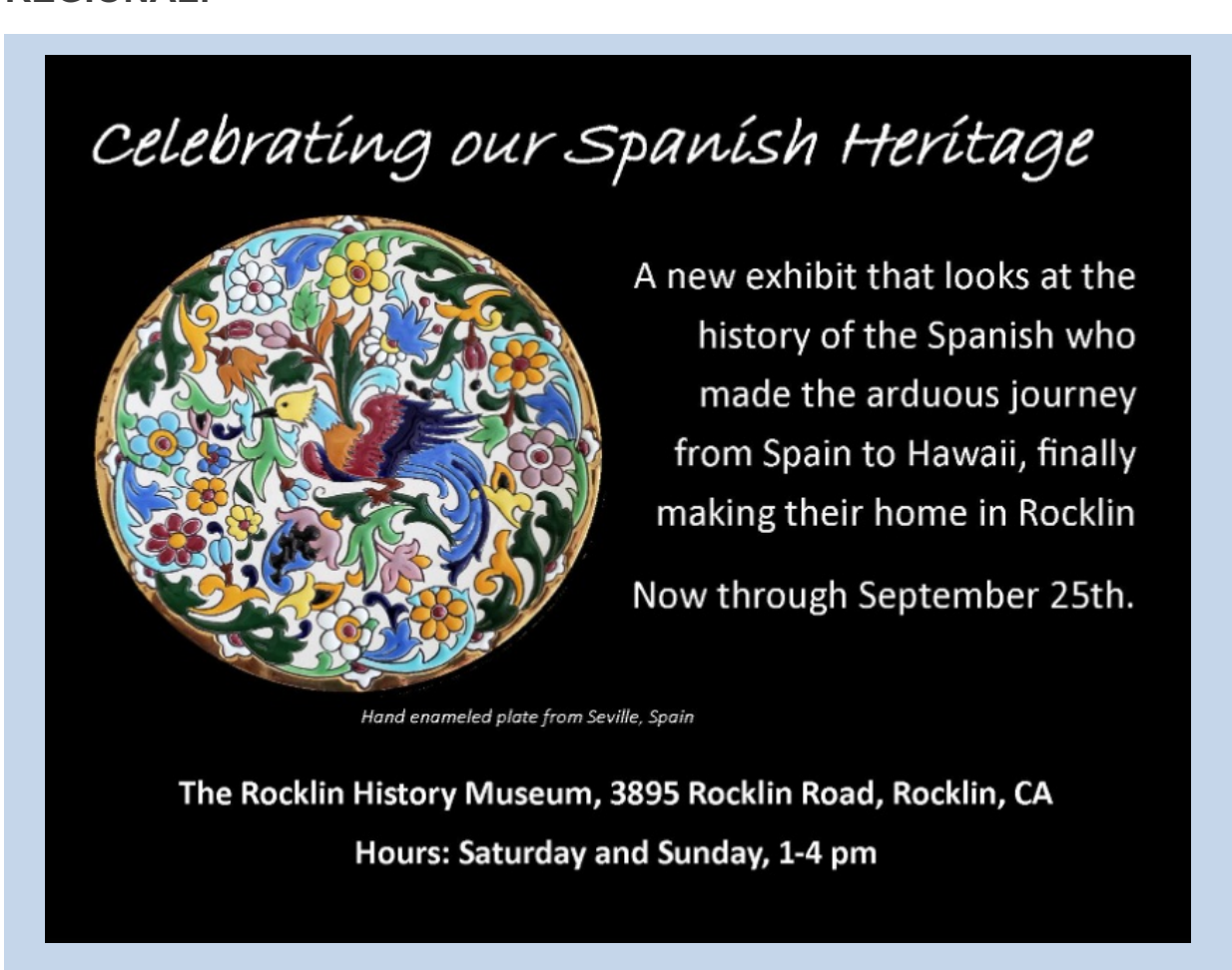
Exhibit ends September 25: Rocklin History Museum