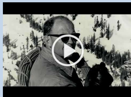
Trailer for documentary film BURIED : the 1982 Alpine Meadows Avalanche

After viewing the film, audiences will be treated to a Q&A with the filmmaker .