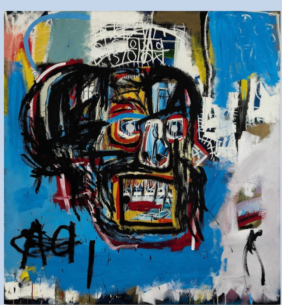
Jean-Michel Basquiat's Untitled (1982) sold in 2017 for $110.5 million.

"The Chaotic Brilliance of Artist Jean-Michel Basquiat" TED-Ed (4:32), provides a brief