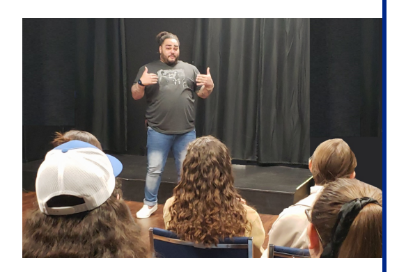
Placer Repertory Theater is a 501(c)(3) nonprofit organization.