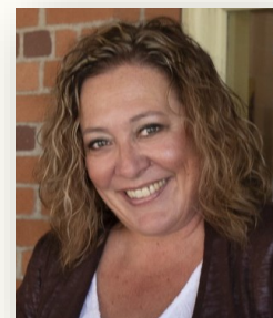
SUSAN POWERS SUSAN POWERS BOOKKEEPING SERVICES YOUR ACCOUNTABILITY PARTNER